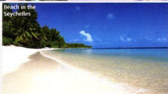
Beach in the Seychelles

A fishing trip might not seem like the world's most posh journey, at least until you hear about the all-inclusive, seven-day Desroches Island Fly Fishing Adventure. First, let's talk about the setting. Desroches is located in the Seychelles, the exotic group of islands in the crystal blue waters north of Madagascar. It is there that you will find your own private villa complete with swimming pool and a fully equipped kitchen. Here's where the magic happens: Your private chef will prepare your meals (including your freshly caught fish) ranging from seafood barbecues to Creole cuisine, complemented by a long international wine list strong in South African selections. The actual fishing happens on the Poivre and St. Joseph's atolls, where a guide will point you to the bonefish, trevally, milkfish and triggerfish cruising in the flats and the sailfish and tuna swimming beyond. After a hard day of reeling in your catch, relaxing should be easy: the resort offers spa services, bike tours, guided snorkeling and more. It's not exactly roughing it, but you don't have to tell that to your fishing buddies back home. The adventure starts at $7,600. frontierstravel.com —KEITH WAGSTAFF