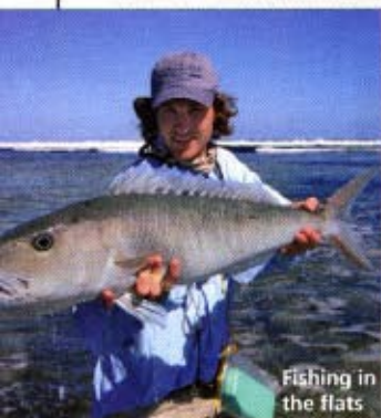
Fishing in the flats